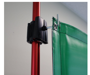
ZipHook used to hang Protecta Sound Curtain