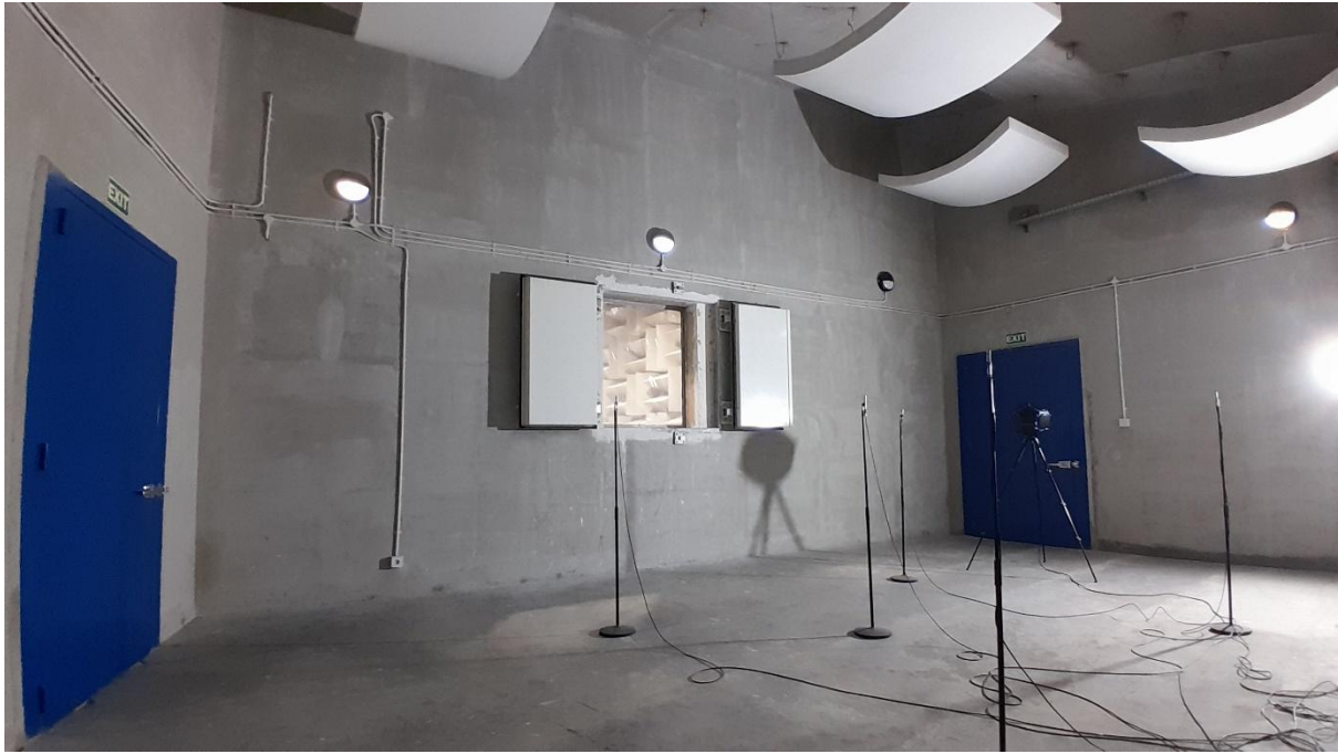
Figure 3. The reverberation chamber used for transmission loss measurements.