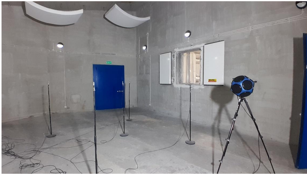
Figure 5. Microphone distribution during measurement.