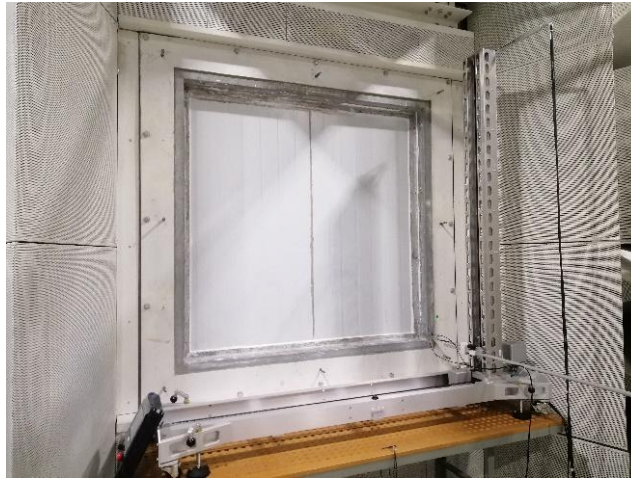
Figure 6. An automatic arm controls the intensity probe during measurement.