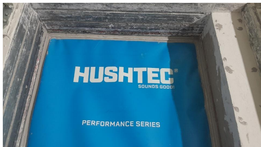
Figure 4. Installation of the product sample to the aperture during measurement.